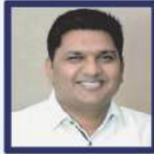
Shri. Prajakt Tanpure

Hon'ble Minister Higher & Technical Education