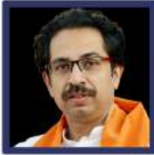
Shri. Uddhav Thackeray