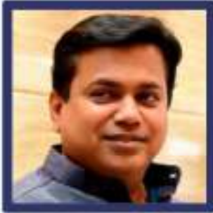
Shri. Uday Samant

Hon'ble Minister Higher & Technical Education