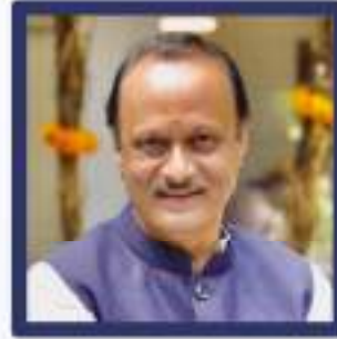
Shri. Ajit Pawar